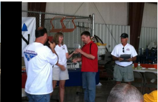
Some glimpses of our last summer's contest!